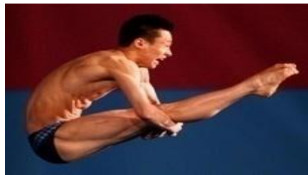
Figure 2. A swimmer diving

Q2: As seen in Figure 2, sportsmen or swimmers who jump off a high platform pull their legs towards themselves when they want to roll in the air. Please explain the reason of this behavior.